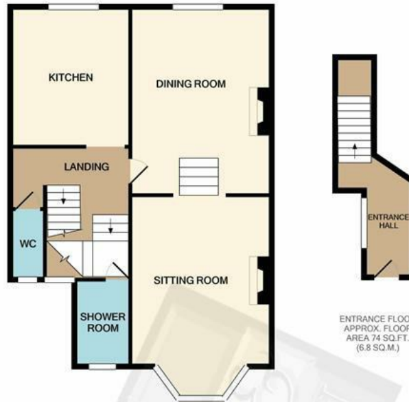
ENTRANCE FLOOR APPROX. FLOOR AREA 74 SQ.FT. (6.8 SQ.M.)