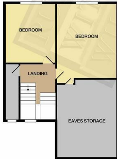
2ND FLOOR APPROX. FLOOR AREA 598 SQ.FT. (55.6 SQ.M.)

TOTAL APPROX. FLOOR AREA 1320 SQ.FT. (122.6 SQ.M.)